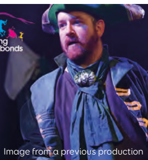
Image from a previous production